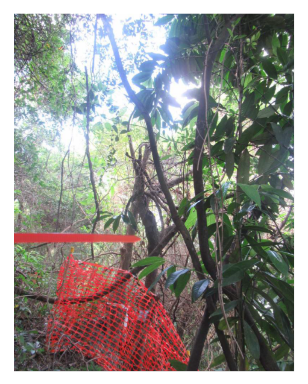
Photo 1 – Tree protection zone for preserved plant species of conservation importance