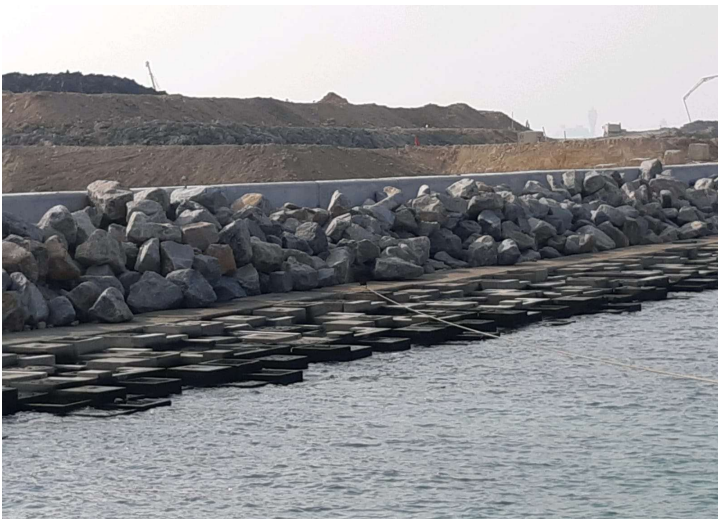
General View of Rocky Eco-shoreline