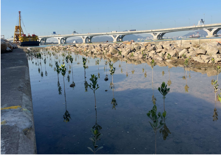
General View of Mangrove Eco-shoreline