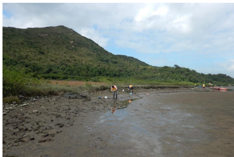
(d) Survey Location at THW