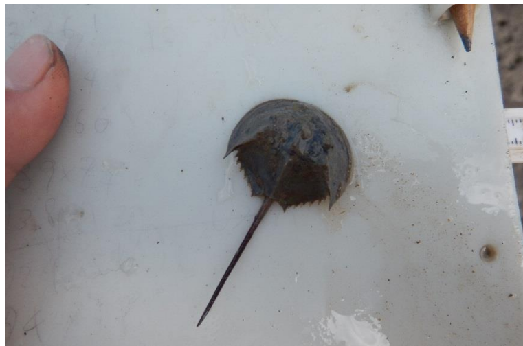
(e) Horseshoe crab Tachypleus tridentatus recorded at THW during Qualitative Walk-through Survey