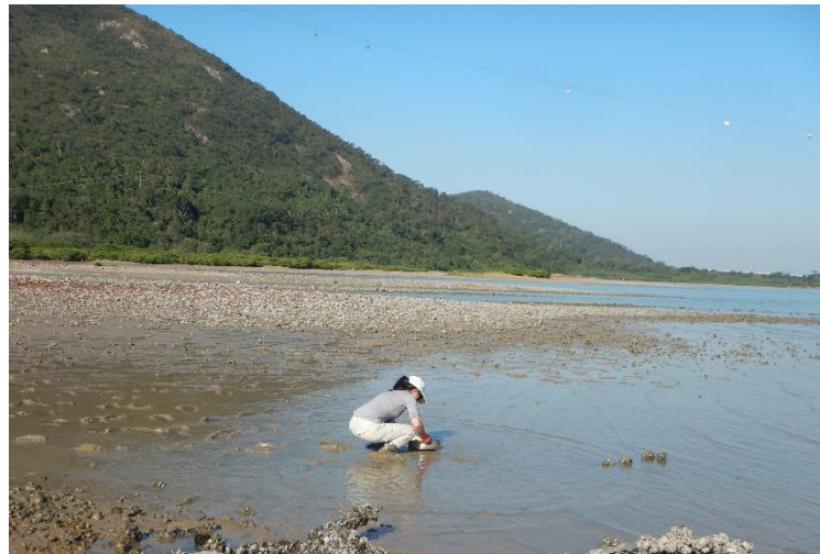
(b) Survey Location at TCB2