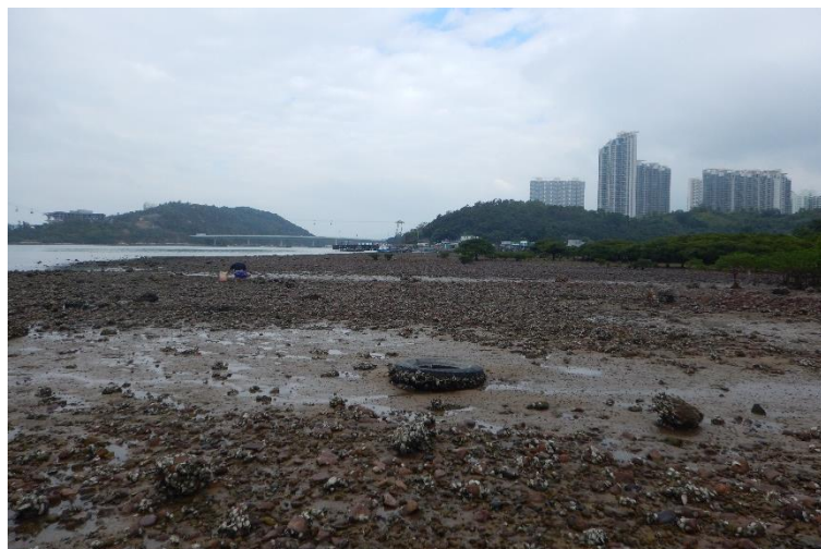
(a) Survey Location at TCB1