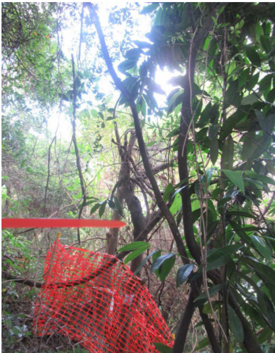
Photo 1 – Tree protection zone for preserved plant species of conservation importance