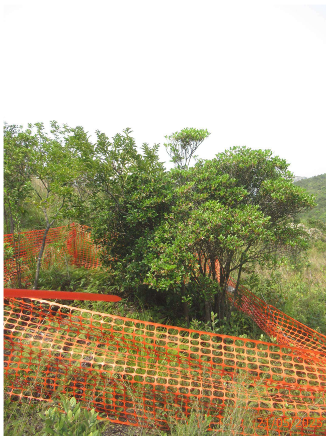
R04 Enkianthus quinqueflorus Observed since November 2023