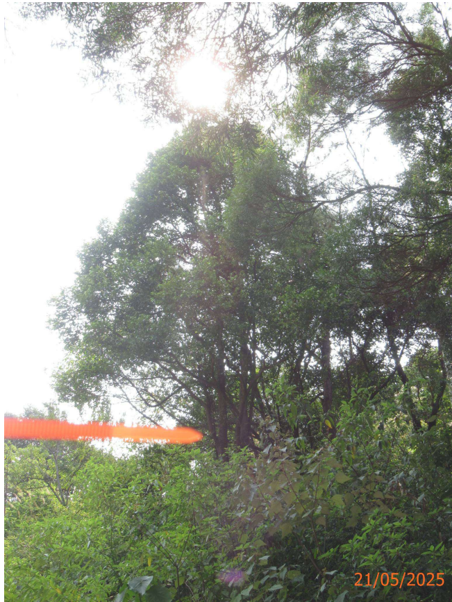
WLH_T047 Aquilaria sinensis Observed since November 2023

Contract No.: NL/2020/02 Tung Chung New Town Extension - Salt Water Supply System Monthly Report (21 May 2025) In-situ Plant Species of Conservation Importance - Photographic Records