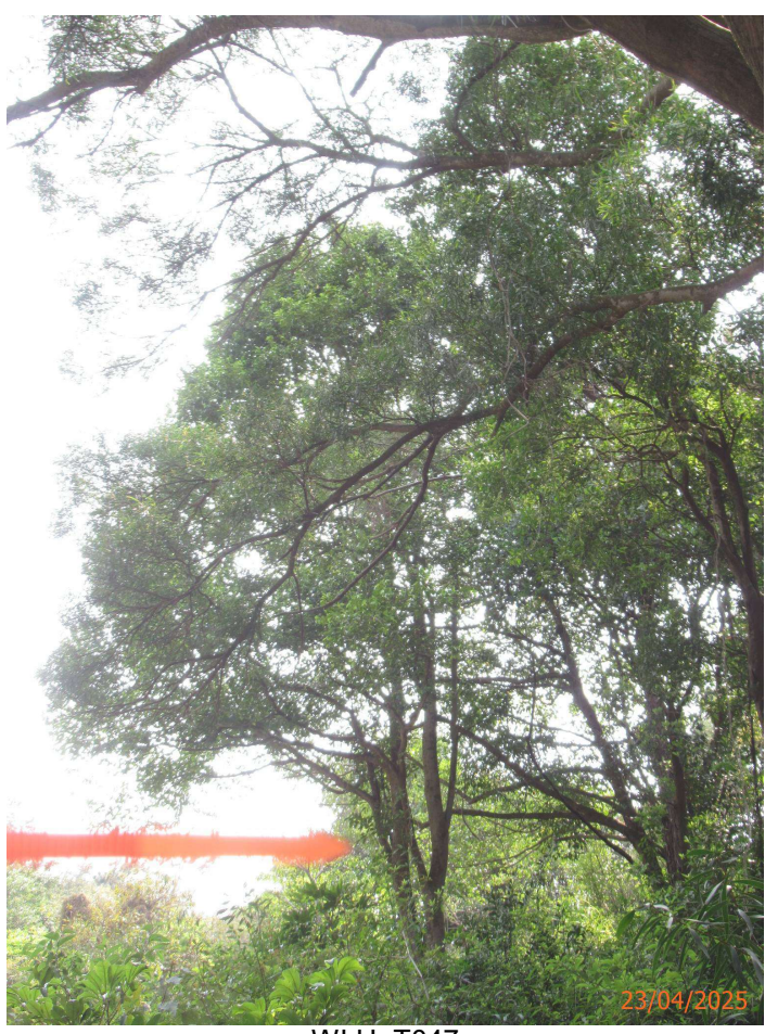
WLH_T047 Aquilaria sinensis Observed since November 2023