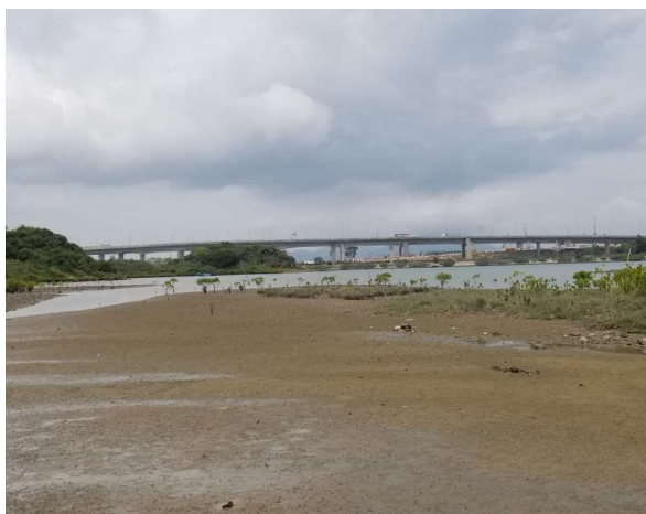
(d) Survey Location at THW