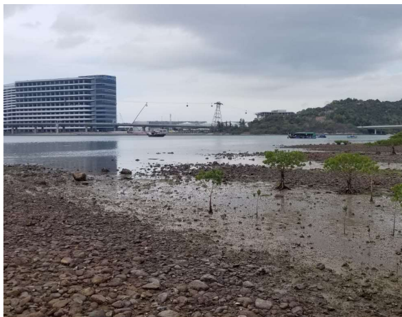
(a) Survey Location at TCB1