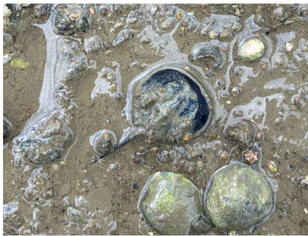
(e) Horseshoe crab Tachypleus tridentatus recorded at TCB1 during the Qualitative Walk-through Survey