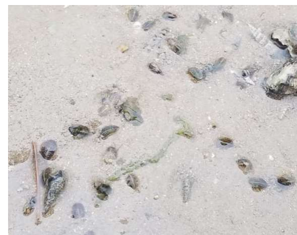
(f) Seagrass Halophila ovalis recorded at TCB3 during the Qualitative Walk-through Survey