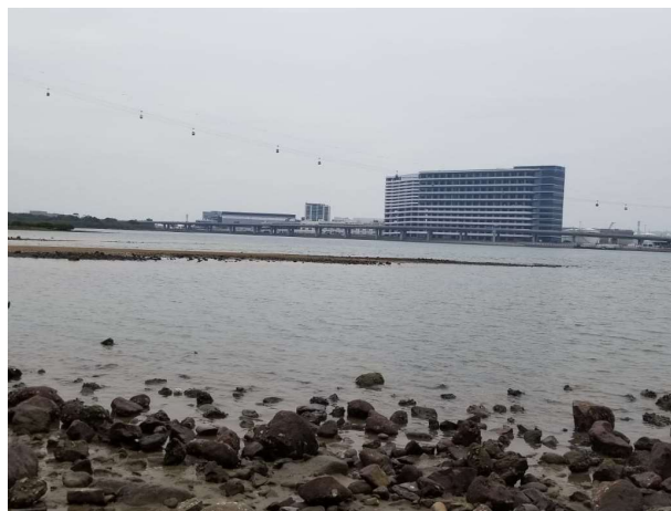
(b) Survey Location at TCB2