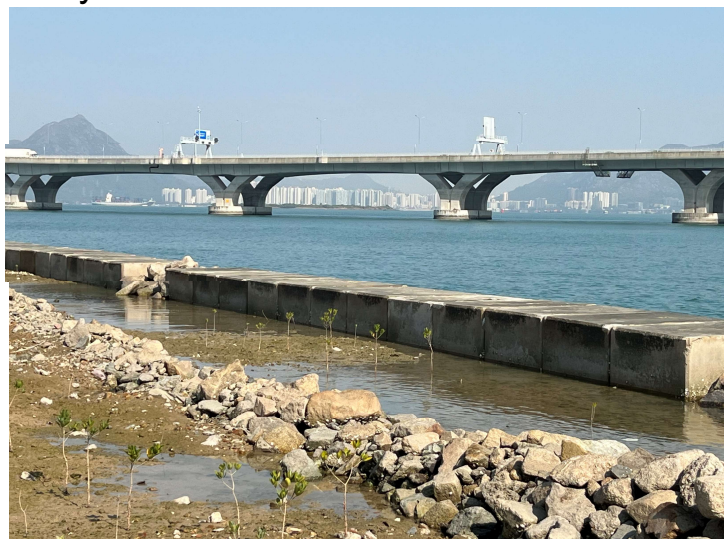
General View of Mangrove Eco-shoreline at Lower Terrace