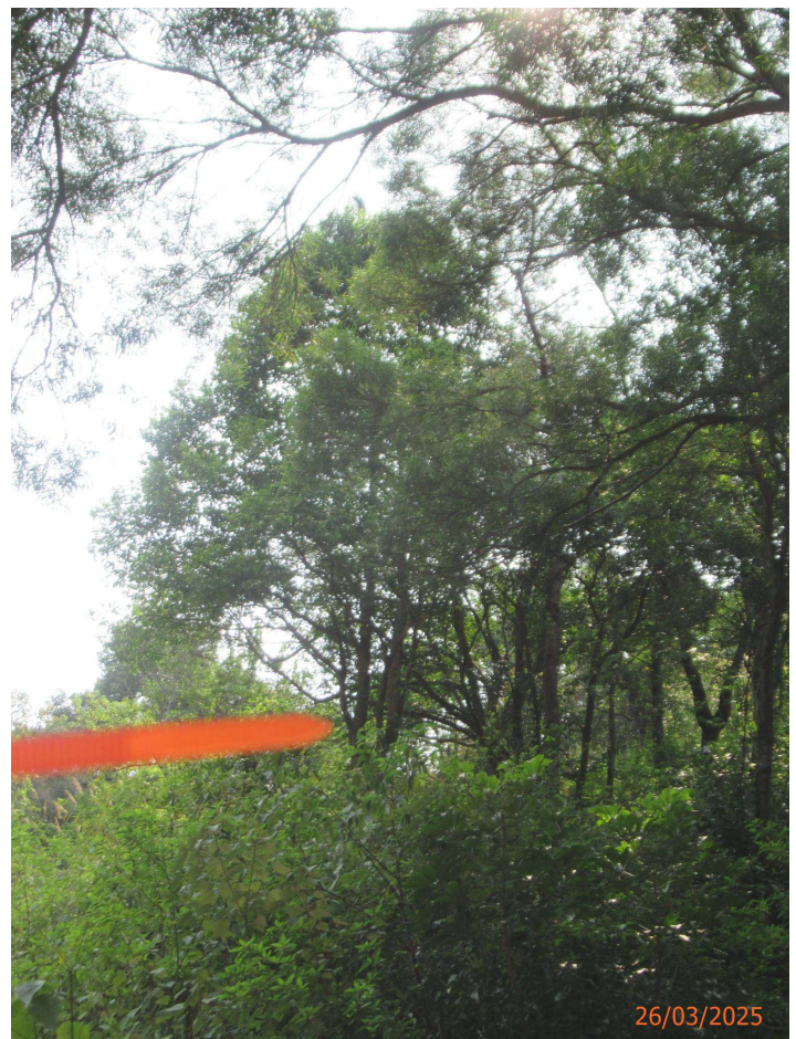
WLH_T047 Aquilaria sinensis Observed since November 2023