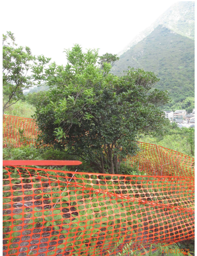
R04 Enkianthus quinqueflorus Observed since November 2023