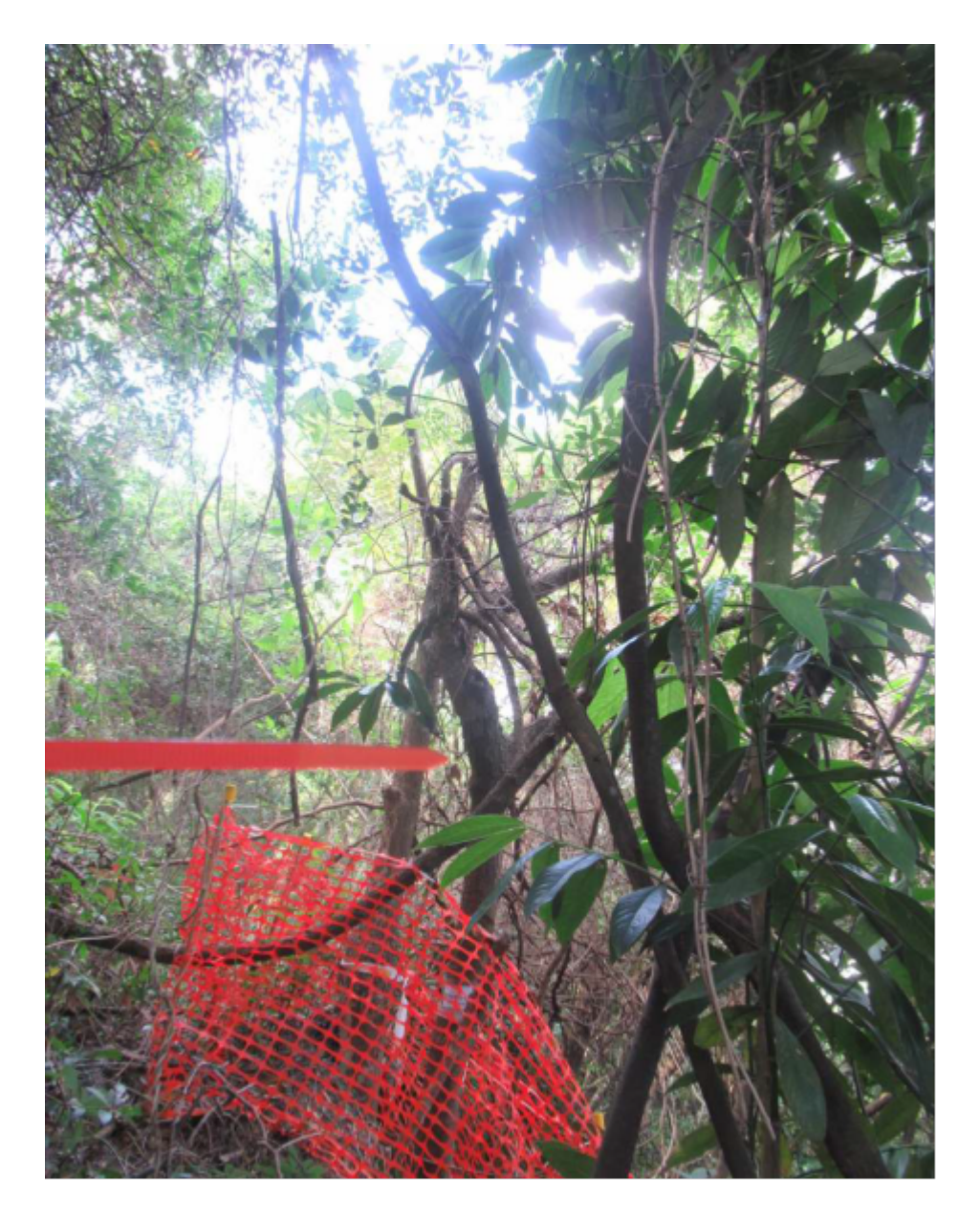
Photo 1 – Tree protection zone for preserved plant species of conservation importance