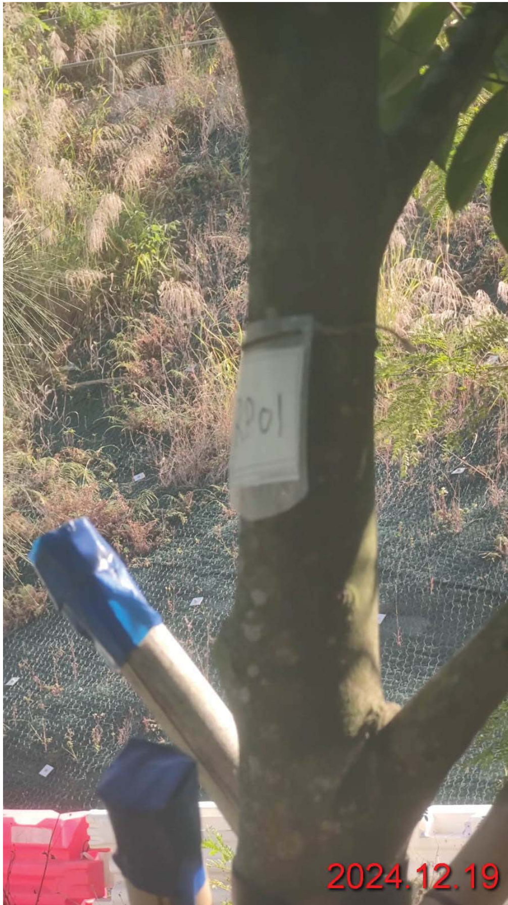
RP01 - Tree Label