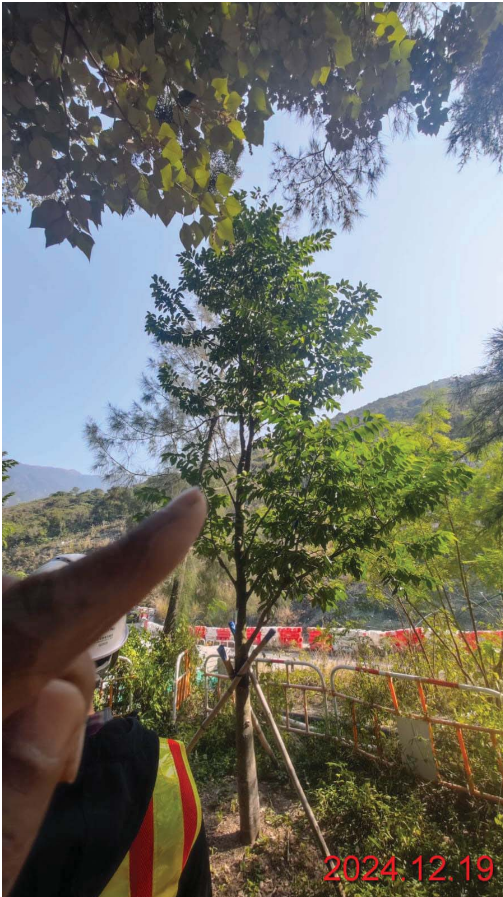
RP02 - Whole View