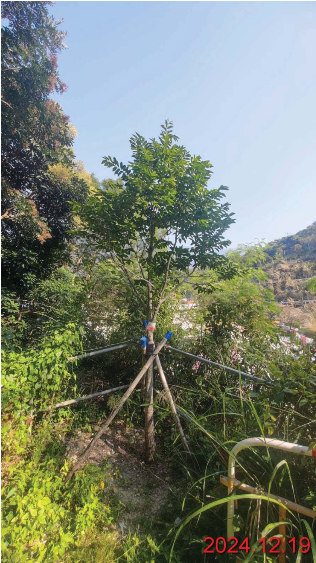
RP01 - Whole View