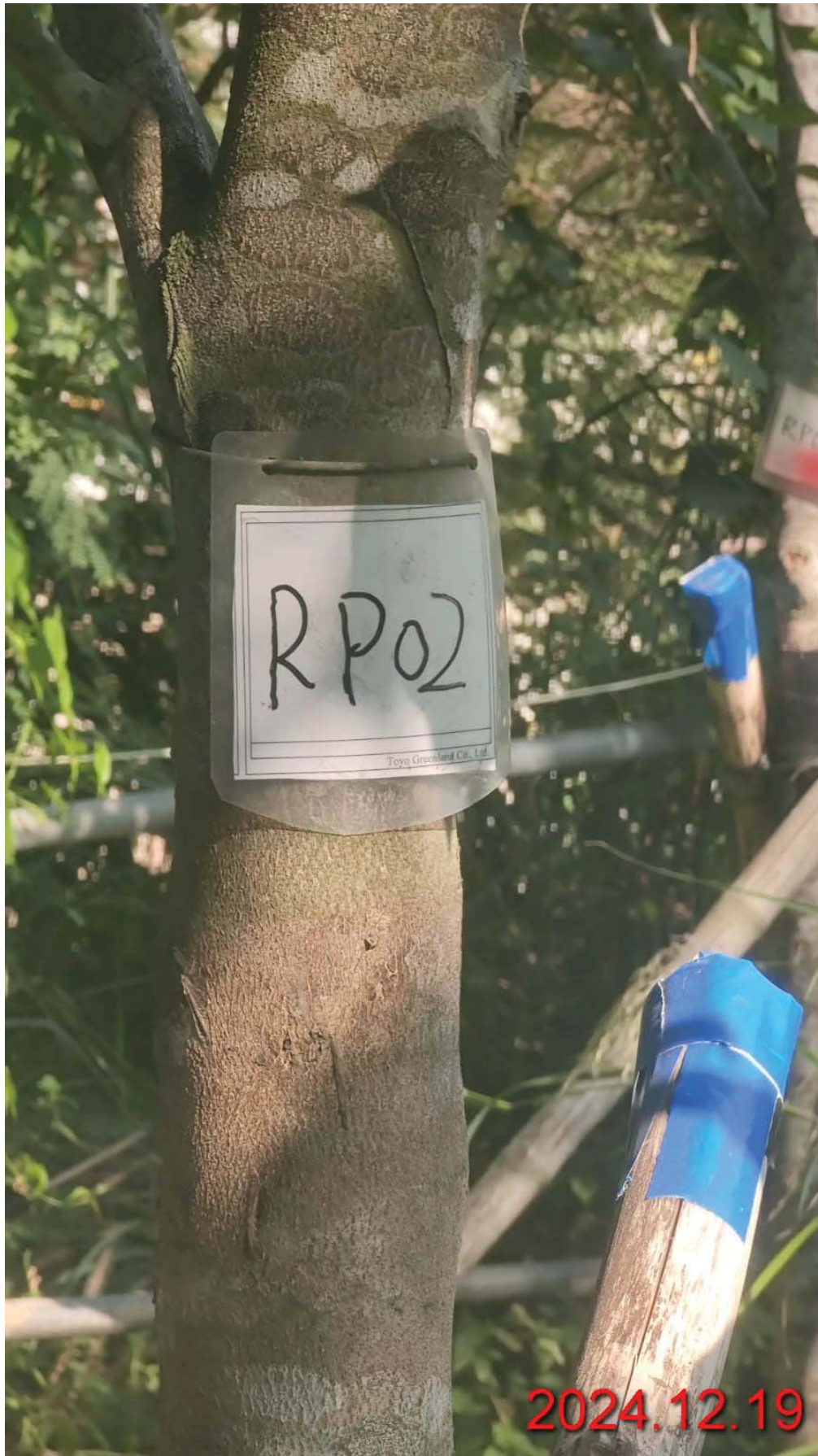
RP02 - Tree Label