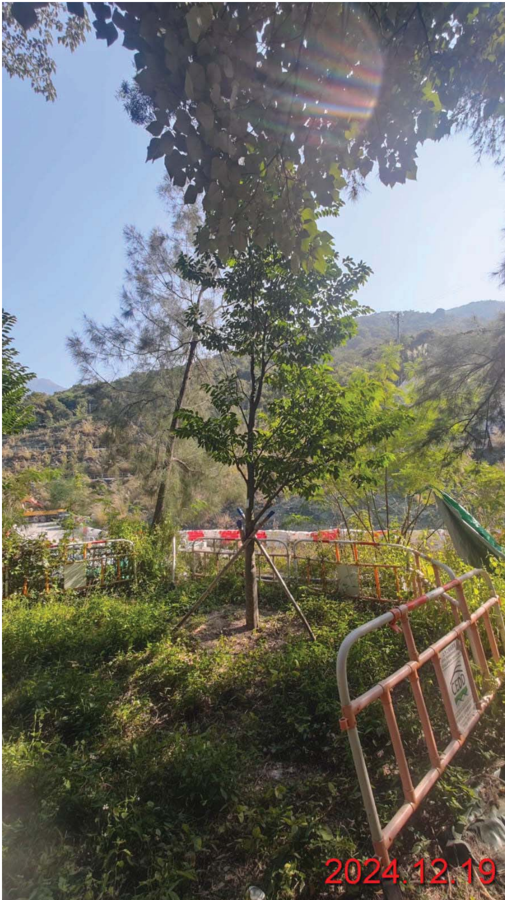
RP04 - Whole View