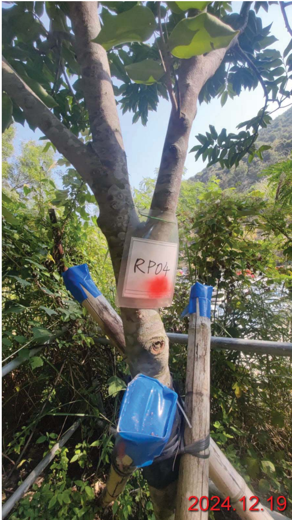
RP04 - Tree Label