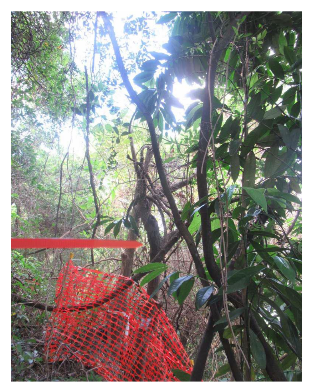
Photo 1 – Tree protection zone for preserved plant species of conservation importance