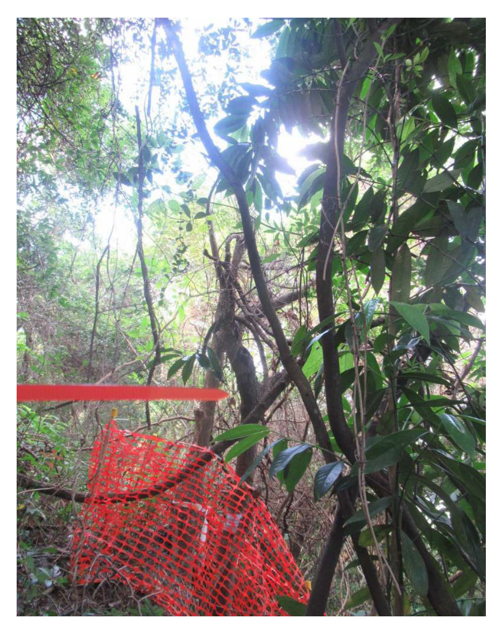
Photo 1 – Tree protection zone for preserved plant species of conservation importance