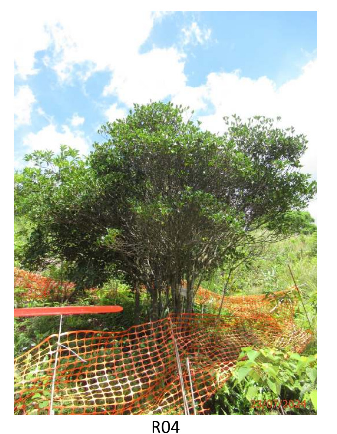
Enkianthus quinqueflorus Observed since November 2023