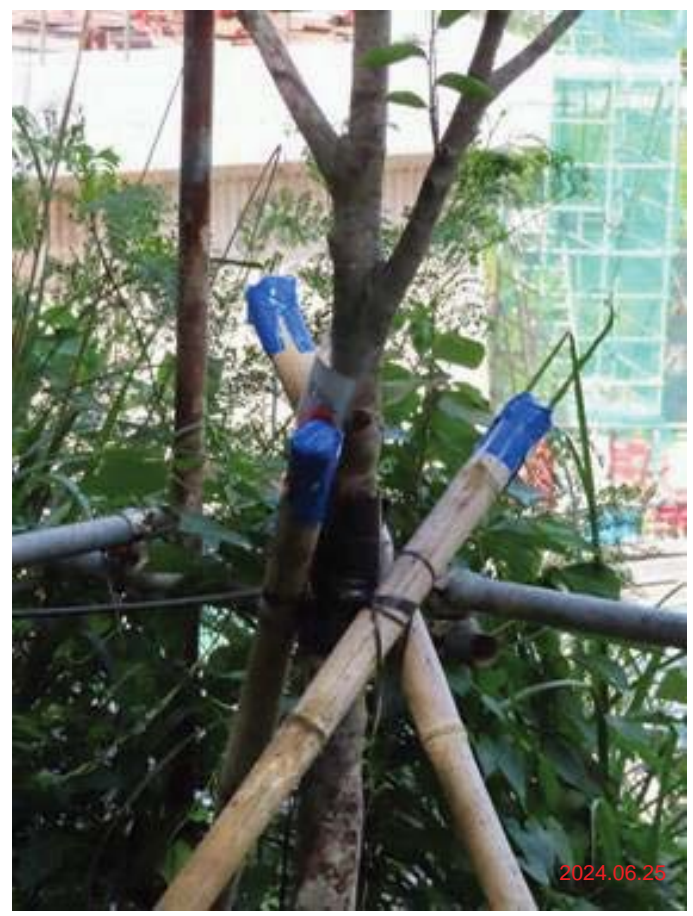
RP04-The holes of the bamboo stakes were sealed