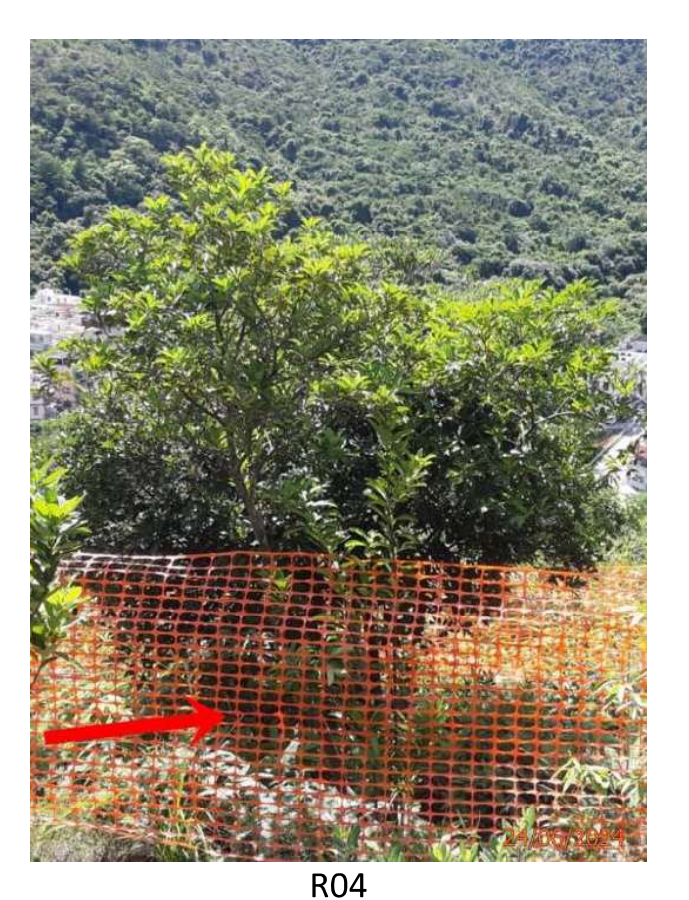
Enkianthus quinqueflorus Observed since November 2023