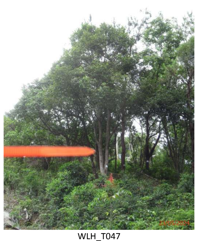
Aquilaria sinensis Observed since November 2023