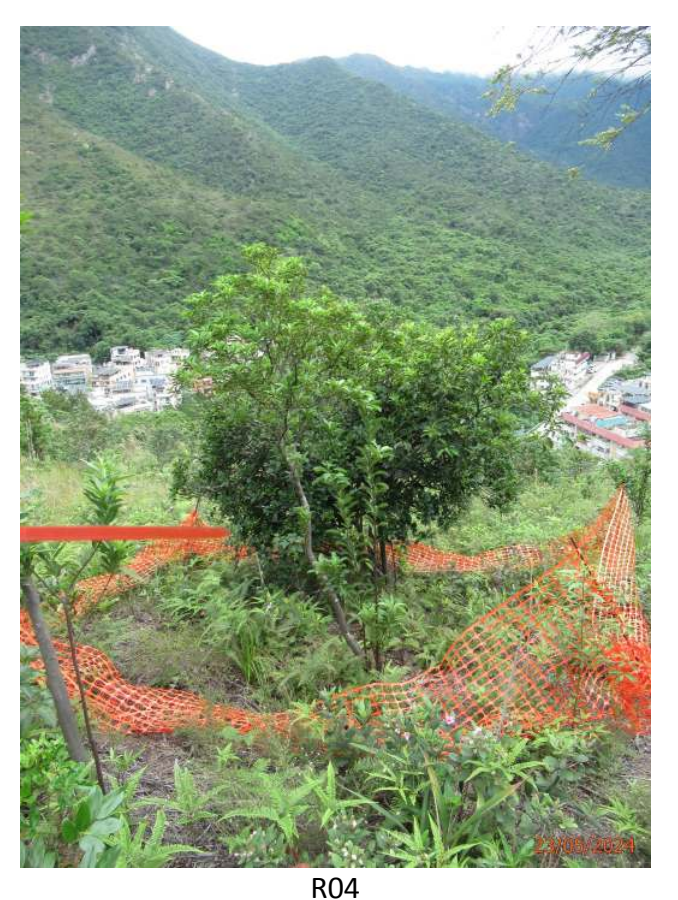
Enkianthus quinqueflorus Observed since November 2023