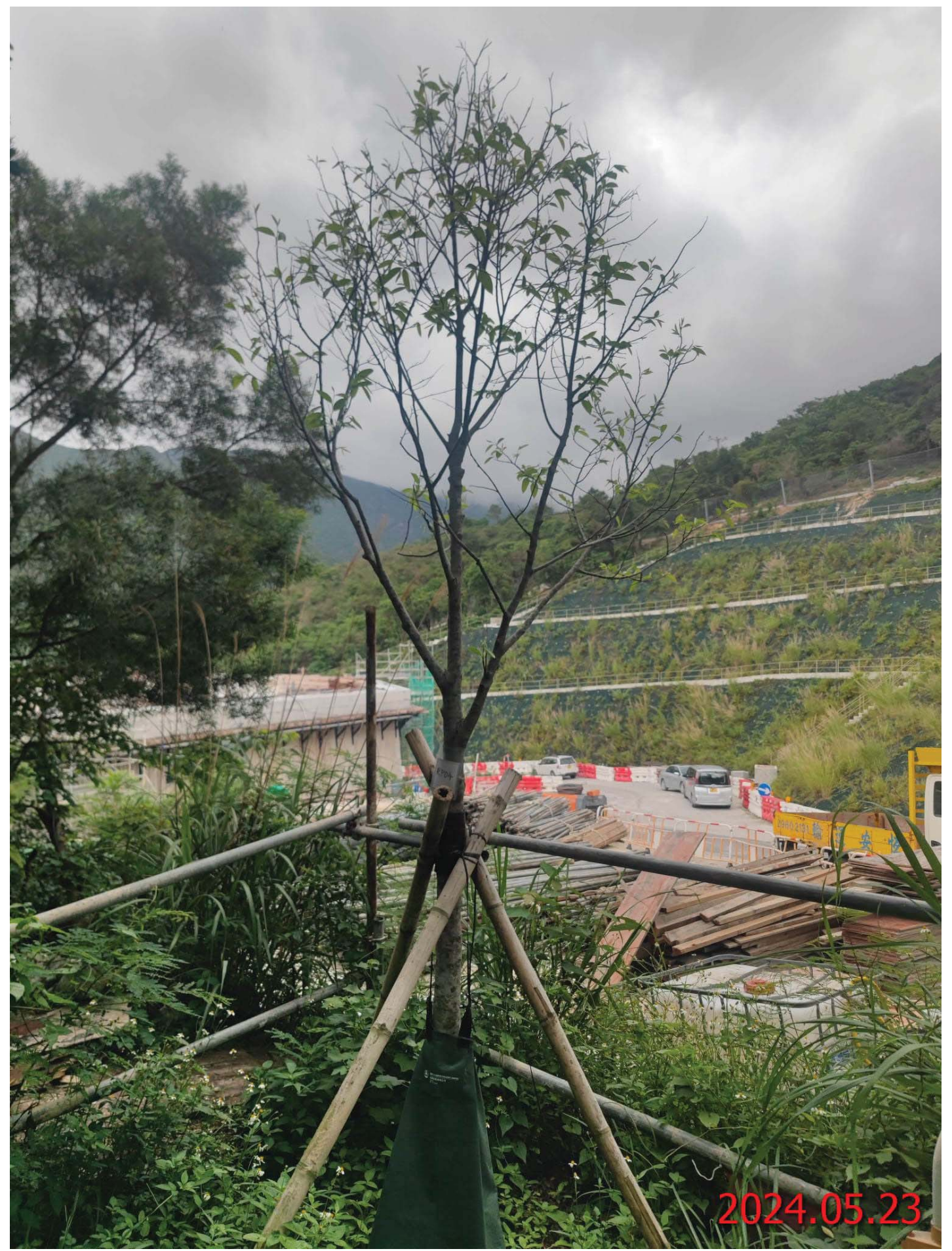
RP04-Whole view of tree