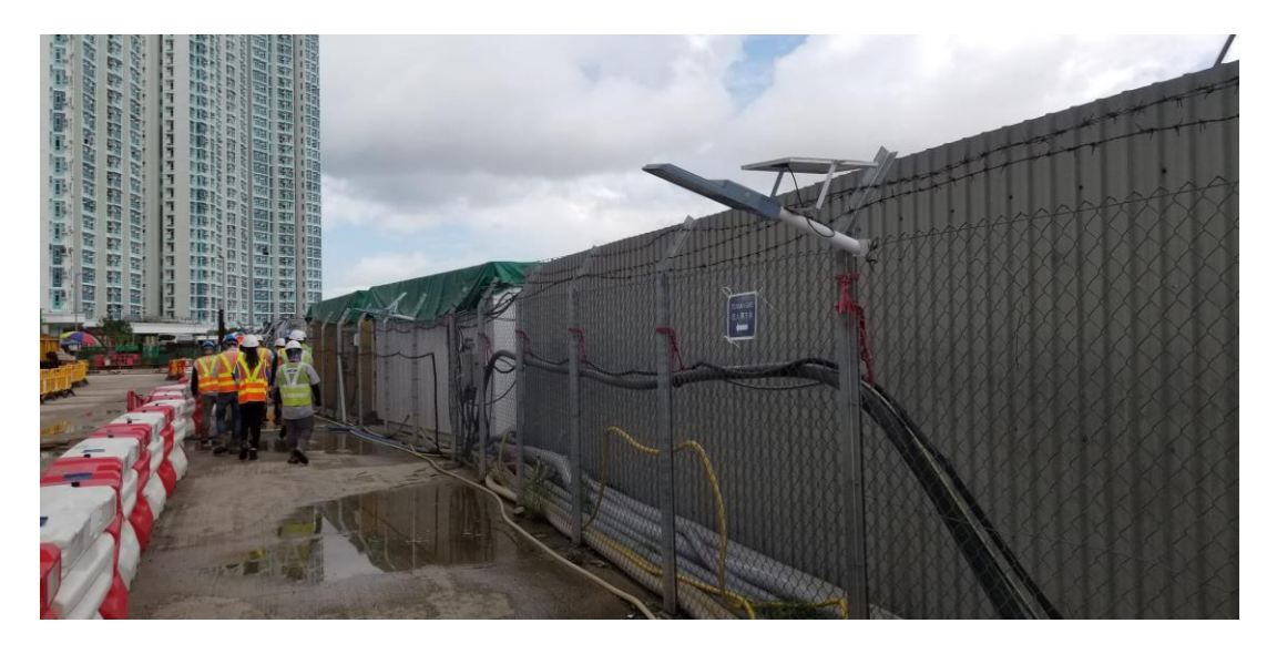
Photo 5 – Orientation of night time lighting to minimize glare impact