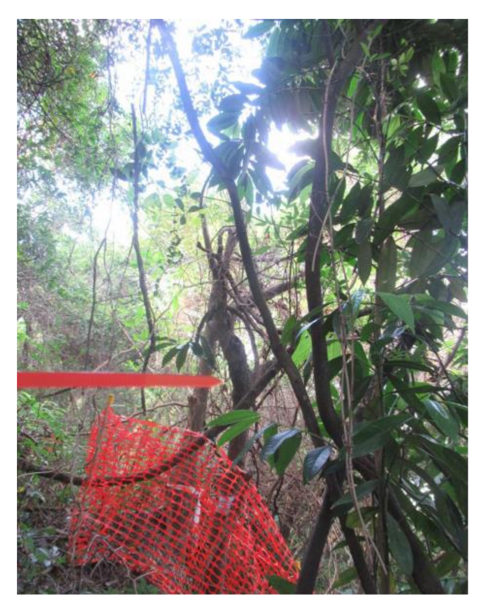
Photo 1 – Tree protection zone for preserved plant species of conservation importance