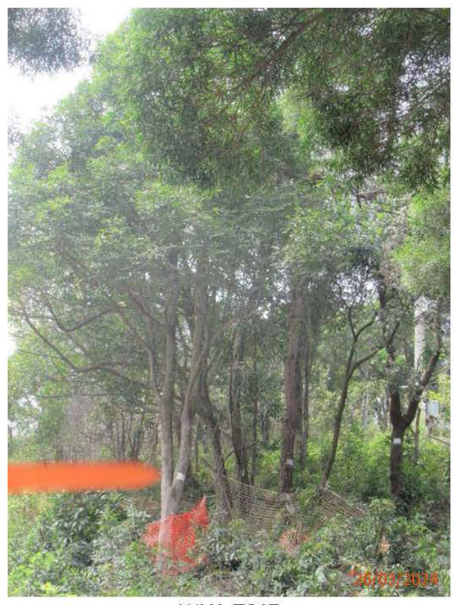
WLH_T047 Aquilaria sinensis observed since November 2023

Contract No.: NL/2020/02 Tung Chung New Town Extension - Salt Water Supply System Monthly Report (26 March 2024)