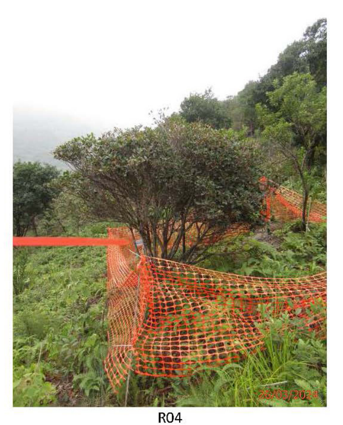
Enkianthus quinqueflorus observed since November 2023