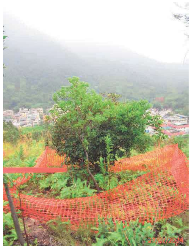
R04 Enkianthus quinqueflorus Observed since November 2023