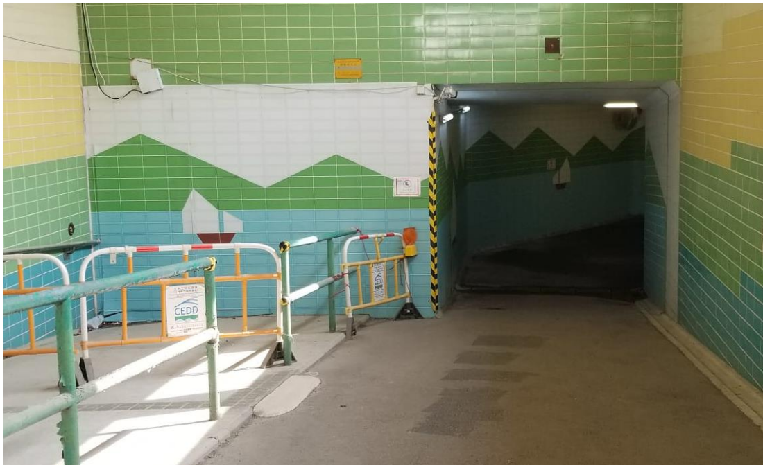
Photo 3 - Erection of site hoardings in unobtrusive colours