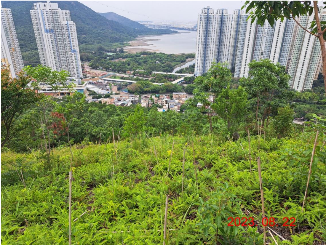
Photo 2 - General view of compensation woodland