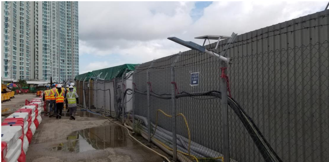
Photo 5 – Orientation of night time lighting to minimize glare impact